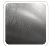
NI Nickel PVD